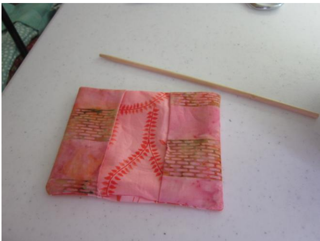
Turn right side out.