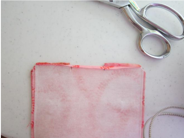
Finger press seam allowance down on both sides of opening. This will make turning the seam allowance to the inside easier.