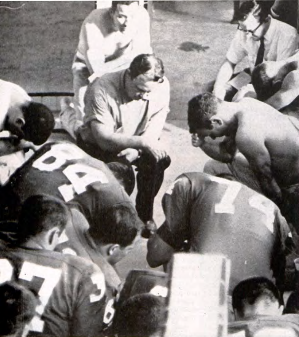
Solemnly Wally Butts leads a Georgia football team in locker-room prayer.