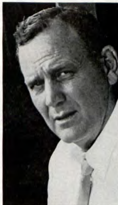
Head coach Paul (Bear) Bryant of Alabama. He took plays for his defending national champions.