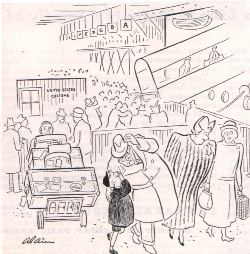
"I smuggled in an unexploded bomb for the living-room mantelpiece!"