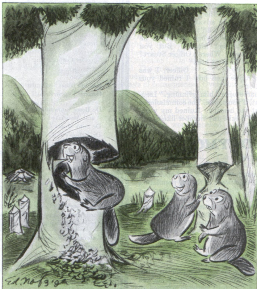
"I guess he'll just have to learn from experience!"

miracle of growth, a tree, man's wonderment at the physical universe, the structure of the atom or mere mathematical infinity. Whatever form is visualized, the neophyte is taught that he must rely upon it and, in his own way, to pray to the Power for strength.