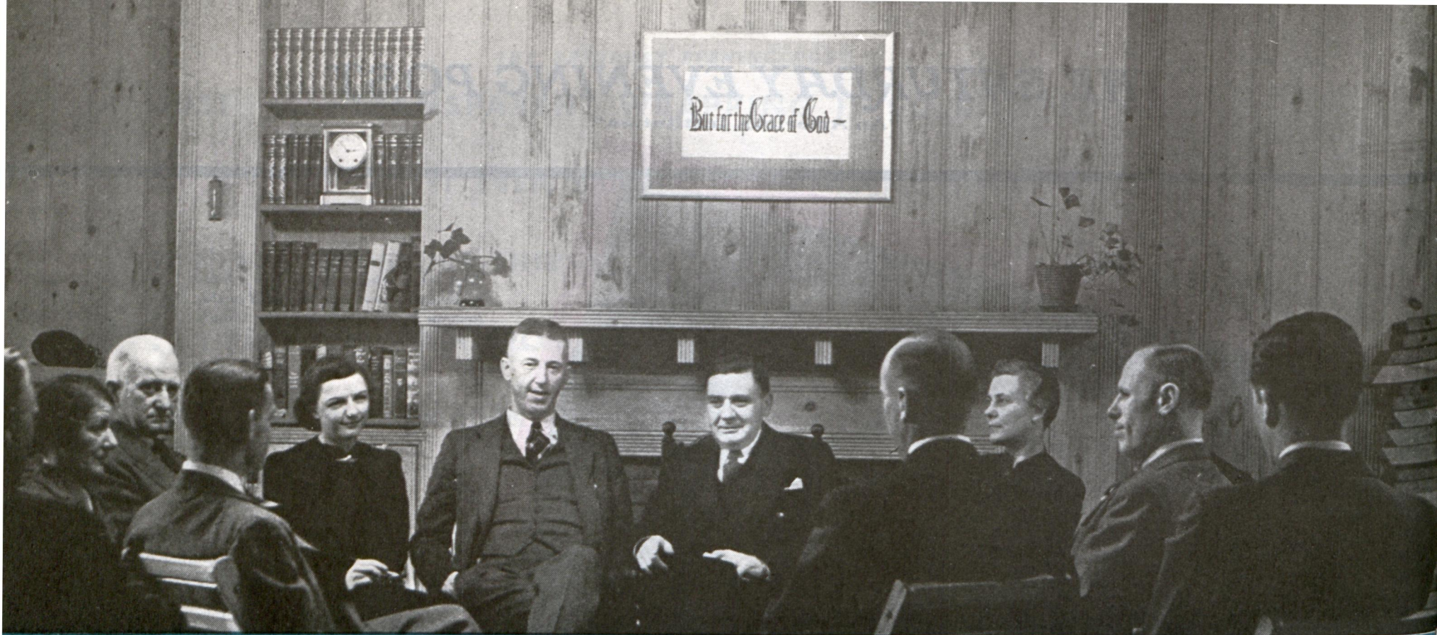
"They are among the most society-loving people in the world, which may help to explain why they got to be alcoholics in the first place." A typical clubhouse discussion group.