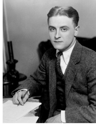
F. Scott Fitzgerald