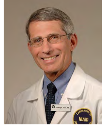
Anthony Fauci, M.D.