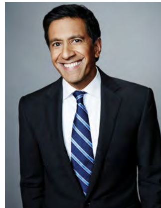
Sanjay Gupta, M.D.