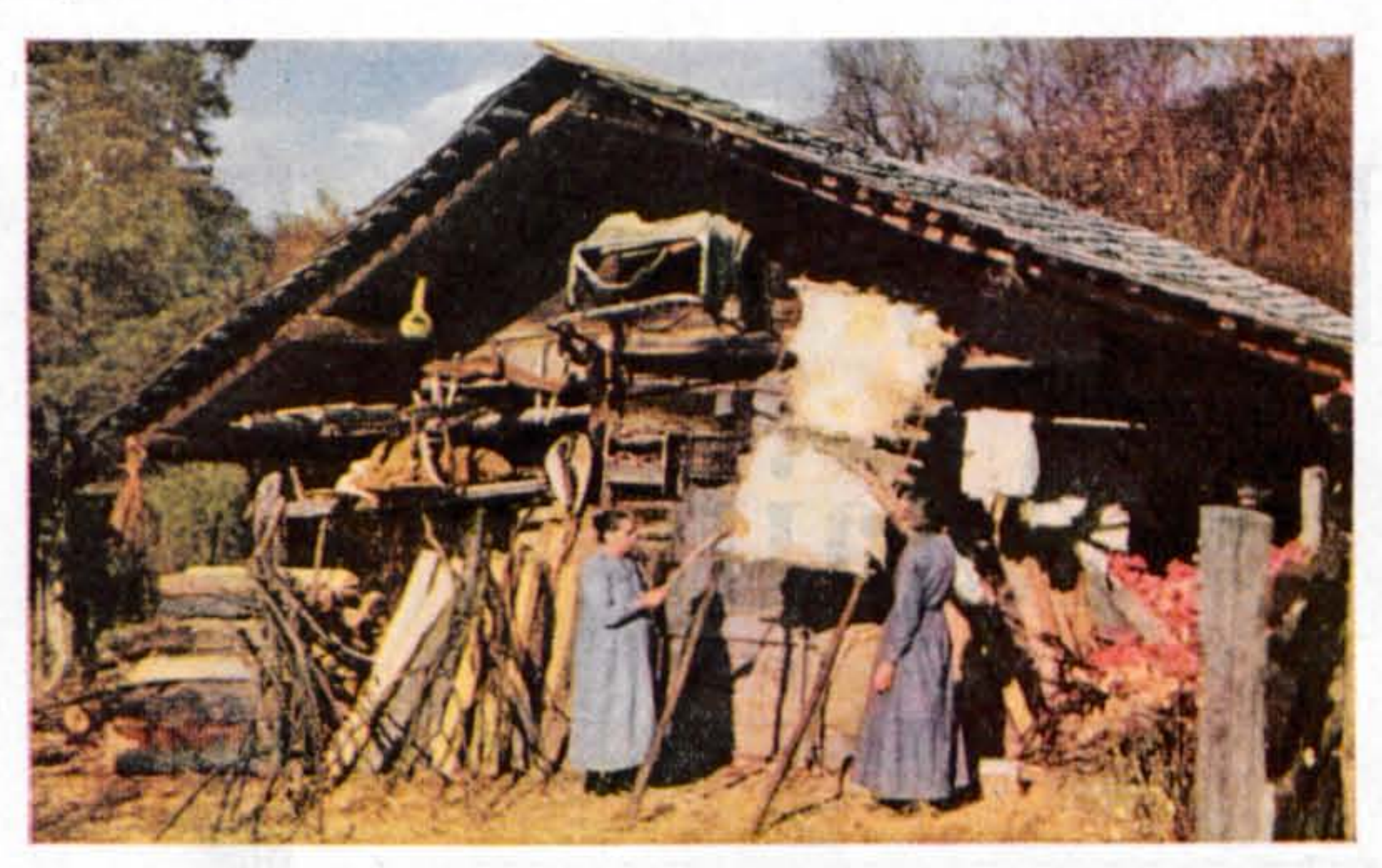
Cutting wood for fuel, shearing sheep or even stretching and drying sheepskin is all in the day's work to the four Walkers.