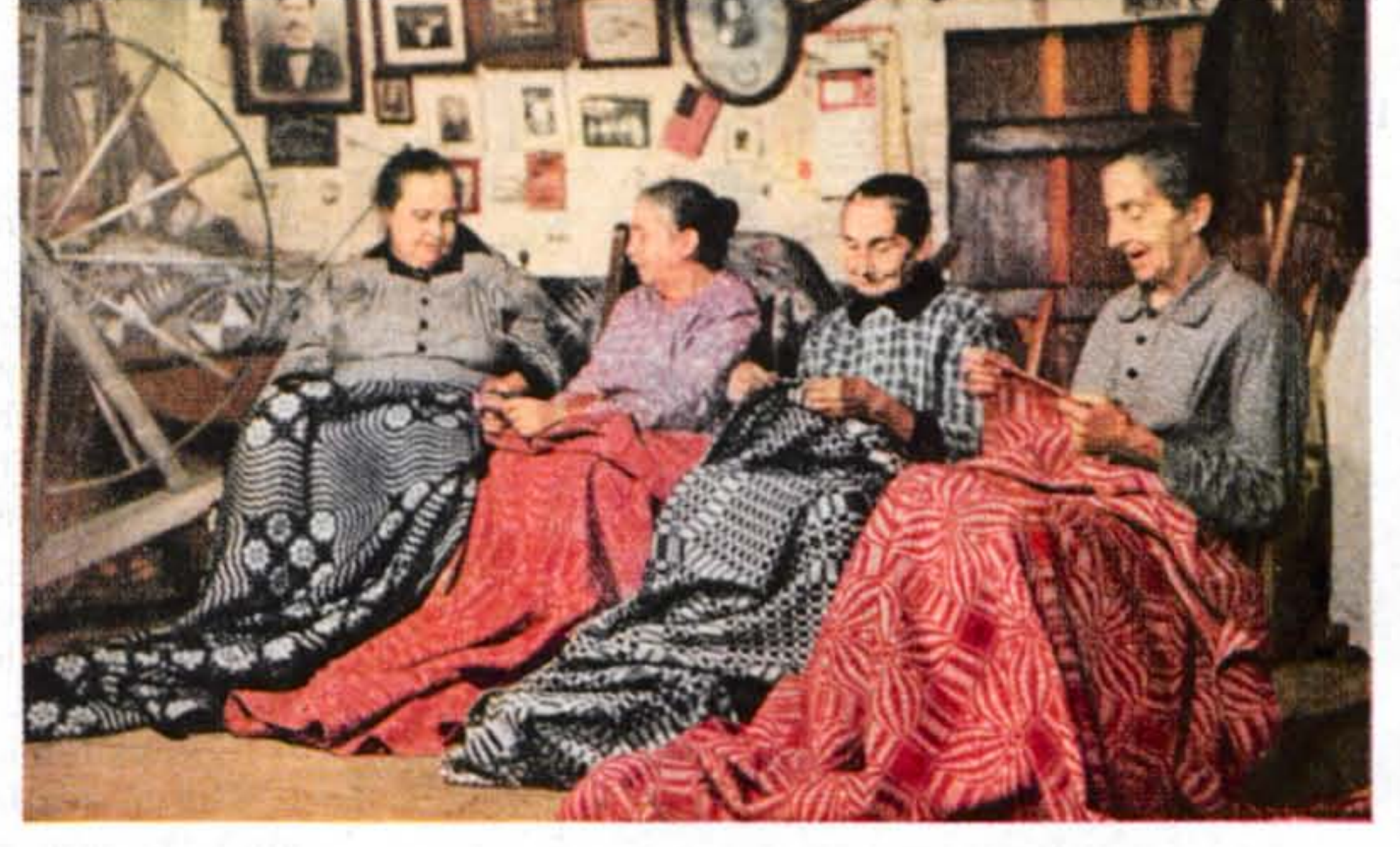
Every thread that went into these colorful coverlets was spun by the sisters on their own old but still efficient wheel.